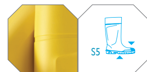
Also available in yellow ref. P2400/2080