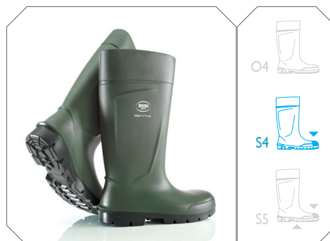
Steplite® Food green - ref. P2300/9180